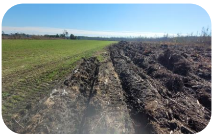
Tree Planting Site Prep Bedded