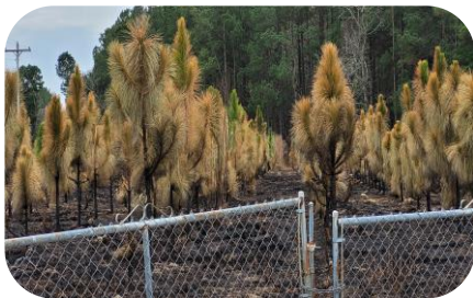
Post LLP Burn