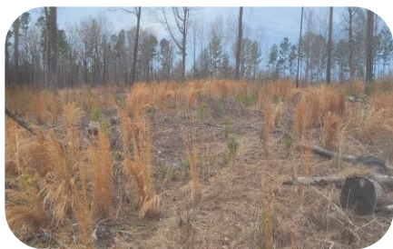
Hand Planted Pines