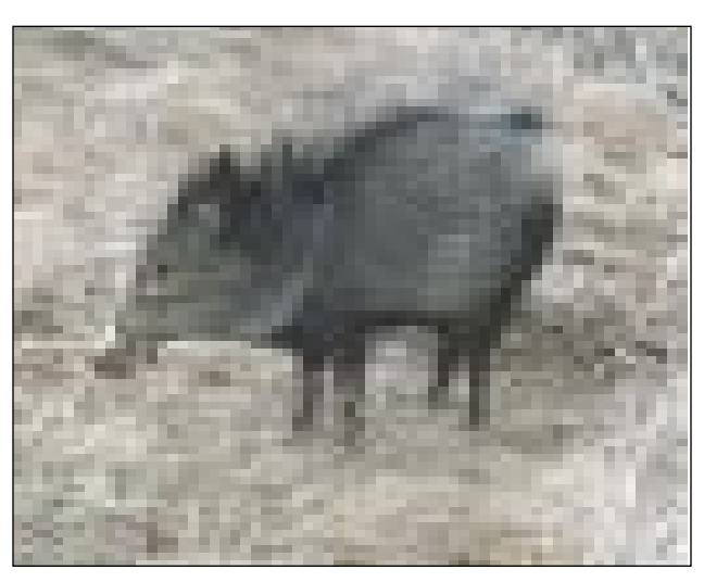
Figure 2 —Wild pigs don't all look alike. Some take after the Eurasian wild boar (top left); others (bottom left) look almost like domestic pigs. The javelina, or collared peccary (above) is native to the Southwestern United States.

The intentional movement of trapped feral pigs has resulted in extensive crossbreeding of feral populations, producing variations in appearance. Wild pigs today are often hybrids: some look like wild boars, and others look more like the common domestic pig in body shape and color. It is often difficult to distinguish wild pigs from domestic swine based on appearance alone.