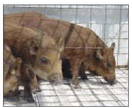
are effective in trapping wild hogs, especially when food supplies are limited, as in winter.