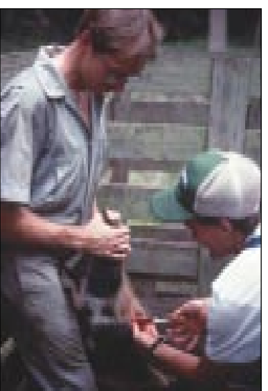
Figure 3— Before you move wild pigs, get them blood-tested by a veterinarian to be sure they are free from diseases that could be transmitted to domestic pigs or people.

Both State and Federal laws govern disease control programs for swine brucellosis and pseudorabies in all classes and types of swine. Relocating wild pigs without negative blood tests for these diseases violates the law. Before wild